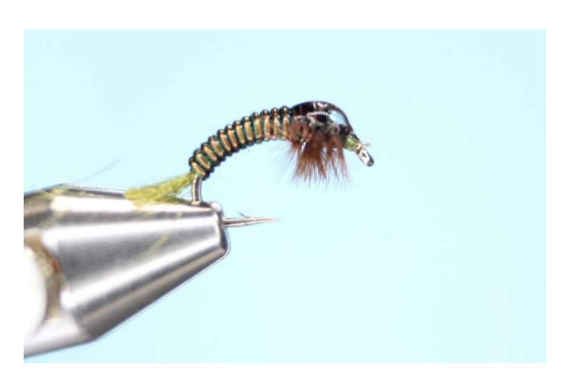
Finished JC Electric Caddis Larva

Editors Notes: This fly can be tied in any color and size. The original pattern was tied in Chartreuse tubing and Chartreuse Antron yarn.