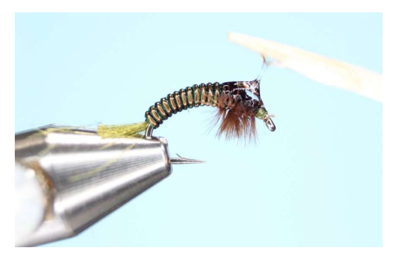
12. Apply a Thin UV Resin to the top for a Wingcase and use the UV lamp to cure it.