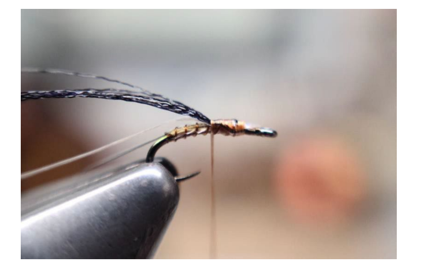
8. Tie in 12 strands of Fluoro Fibre on top of hook shank at the 2/3 point of the hook just before the hook point

7. Tie on UTC pearl Medium Tinsel (IceBlue) on top of hook shank and advance your thread towards the 2/3 point of the hook just before the hook point while maintaining the Tinsel on top of the shank.