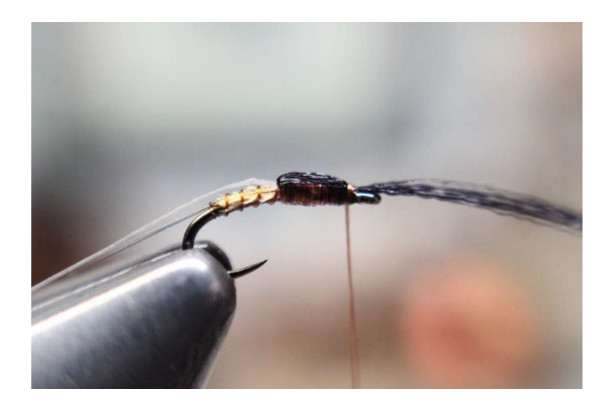
10. With your thread at the eye of the hook pull over the fluoro fibre and capture it with two securing wraps of thread.

9. With the materials tied in begin the process of building the thorax, this is done with repetitive wraps of thread in the thorax area until the shape of a football is achieved.