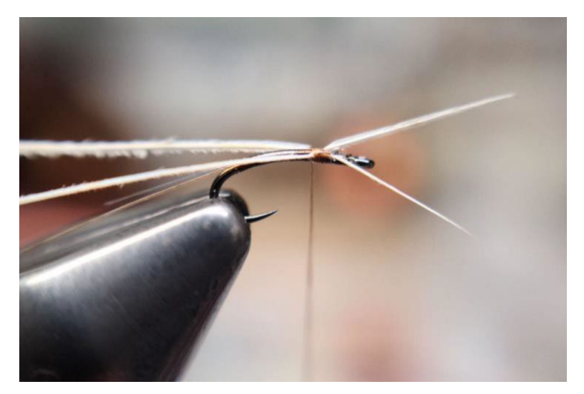
4. Tie in a single ploom of Turkey Primary Wing Feather on each side of the shank.

3. Tie in a piece of brown Ice Thread monofilament on the side of the shank closest to you with a few tight wraps then advance your thread towards the eye of the hook making touching turns of thread. This will help keep the slim profile of the fly.