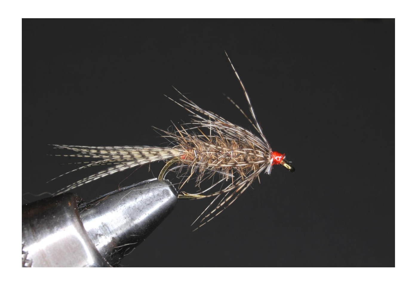
Step 8 Wrap the Partridge feather 2 1/2 to 3 wraps, stroke each wrap reward towards the bend of the hook. Then secure the feather in place and trim the excess. Whip finish and add head cement.