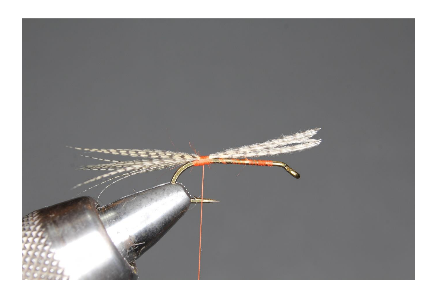
Step 2 Tie in wood duck fibers at the bend of the hook. These are not the standard proportion for tying in a tail. Dave tied his tail 1 and 1/4 the length of the shank of the hook.