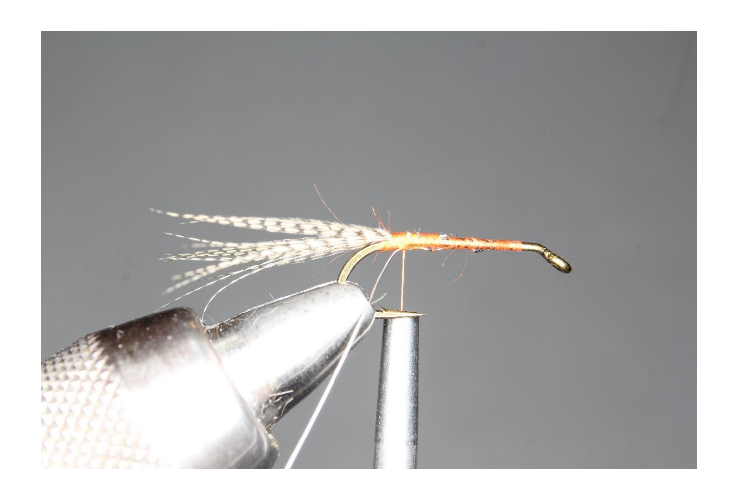
Step 4 Tie in the fine silver wire under the shank of the hook to the bend of the hook.