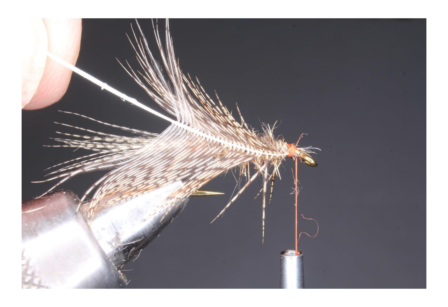
Step 7 Take a brown Partridge feather. Fold it and tie it in by the tip. Once secured to the shank of the hook cut the tip.