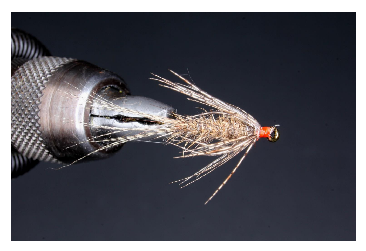
Step 9: Top view of the finished SplitTail Flymph.