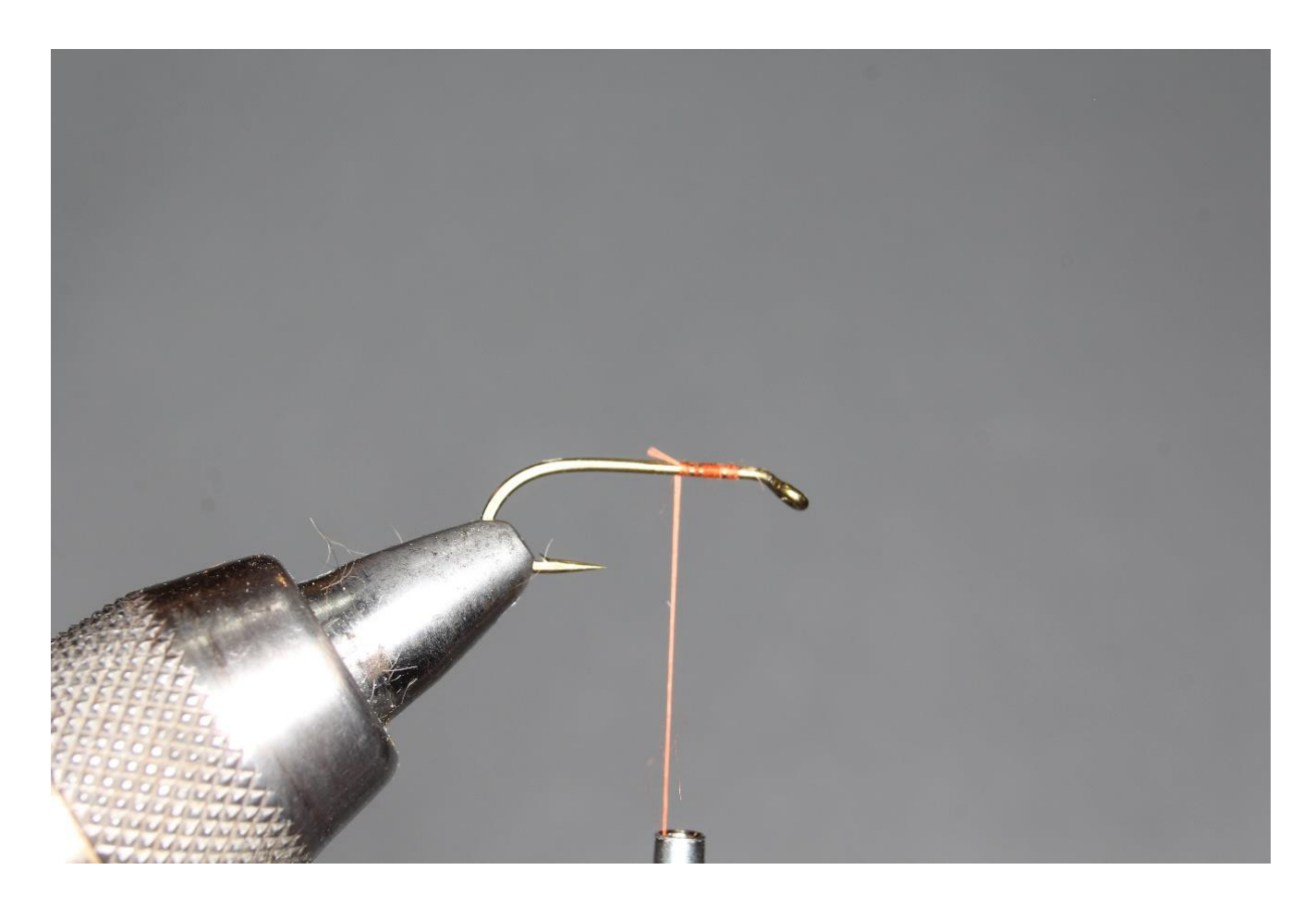
Step 1 Please hook in the vise and attach the tying thread.