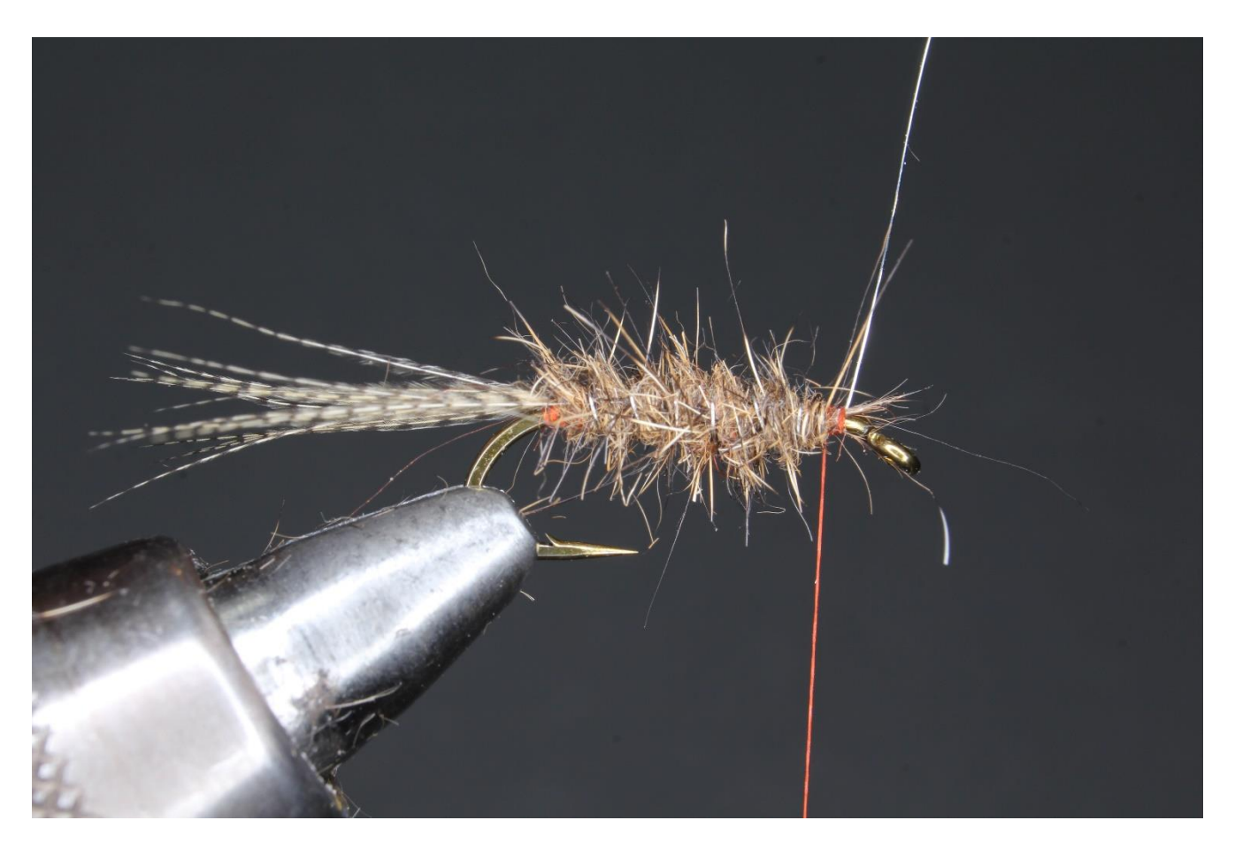
Step 6 Rib the body with the silver wire in open turns. Going in counter wraps. Wrapping the body in the opposite direction of the dubbing body direction. Usually 5 or 6 turns.