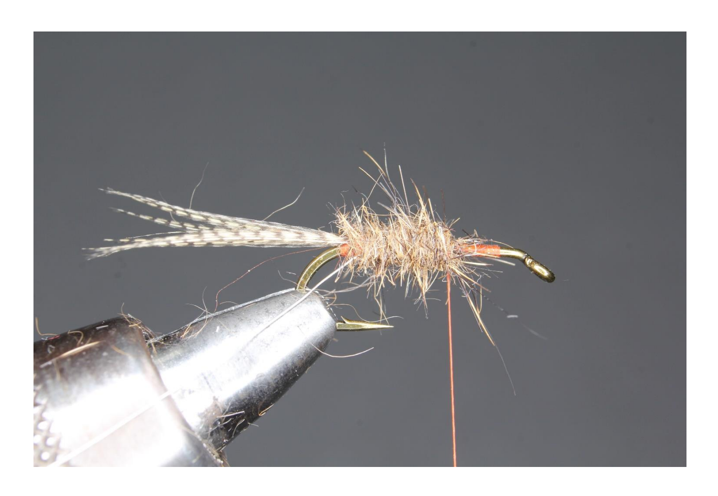
Step 5 Dub a tapered body with the mixture of red squirrel body, dark hare's ear mask and small amount of clear antron. I dubbed the body 3/4 of the shank of the hook or at least 3 eye lengths behind the eye.