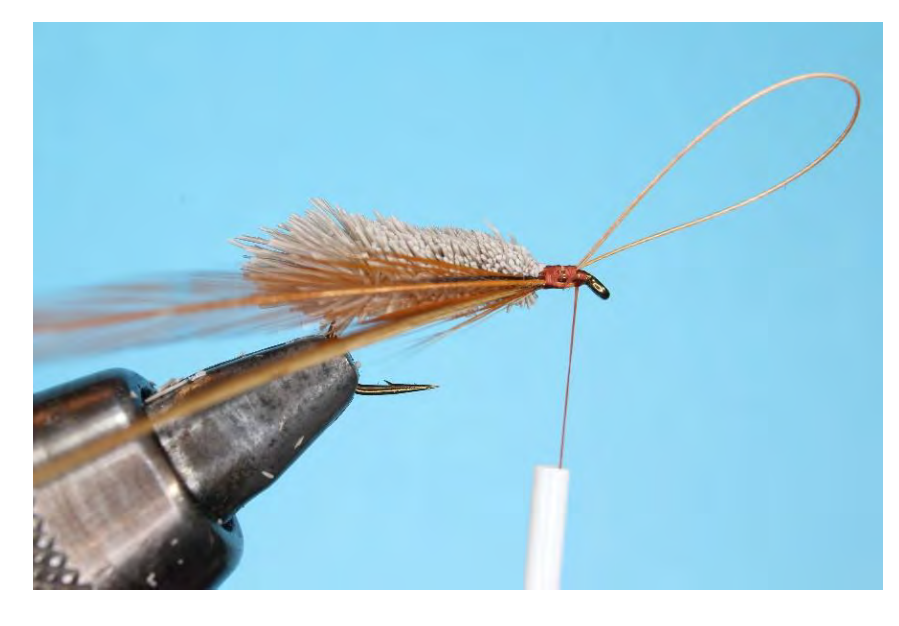
Step 11 Tie in two brown hackles.

Strip a brown hackle and shape the stem as a loop and tie it in. This will be the antennae.