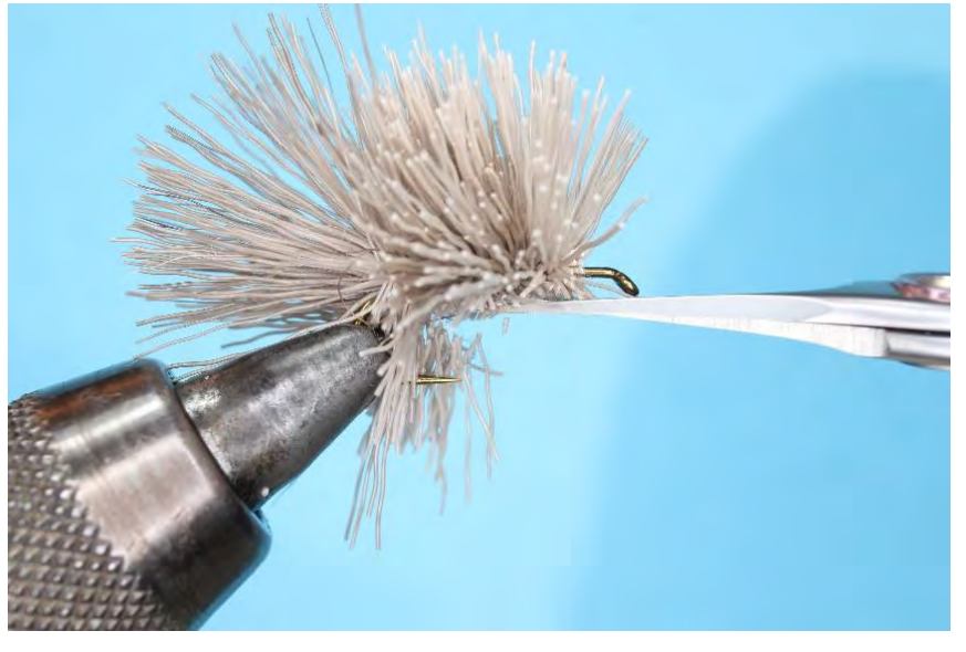
Step 8 Trim the deer hair flat under the shank of the hook.