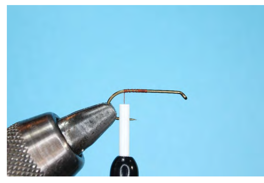
Step 1 Place your bead on the hook and place it in the vise.