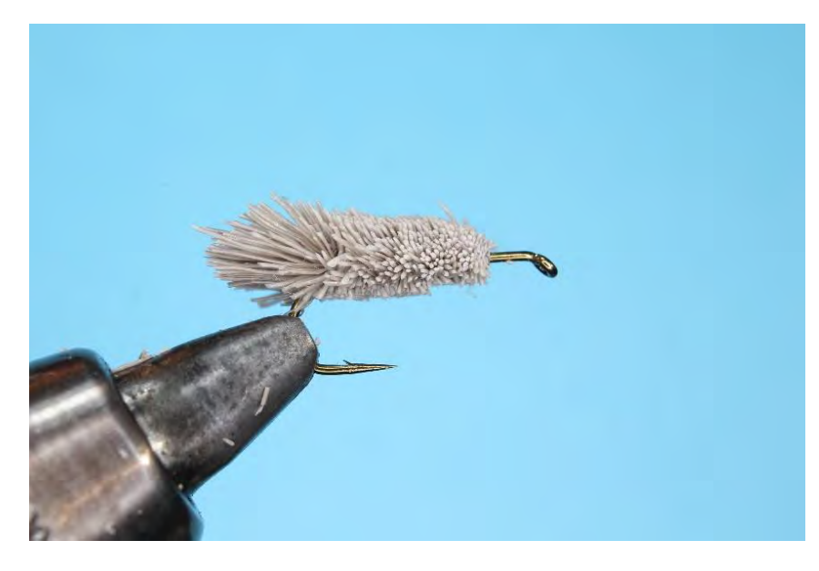
Step 9 Trim the deer hair into a trianglular shape as a caddis fly.