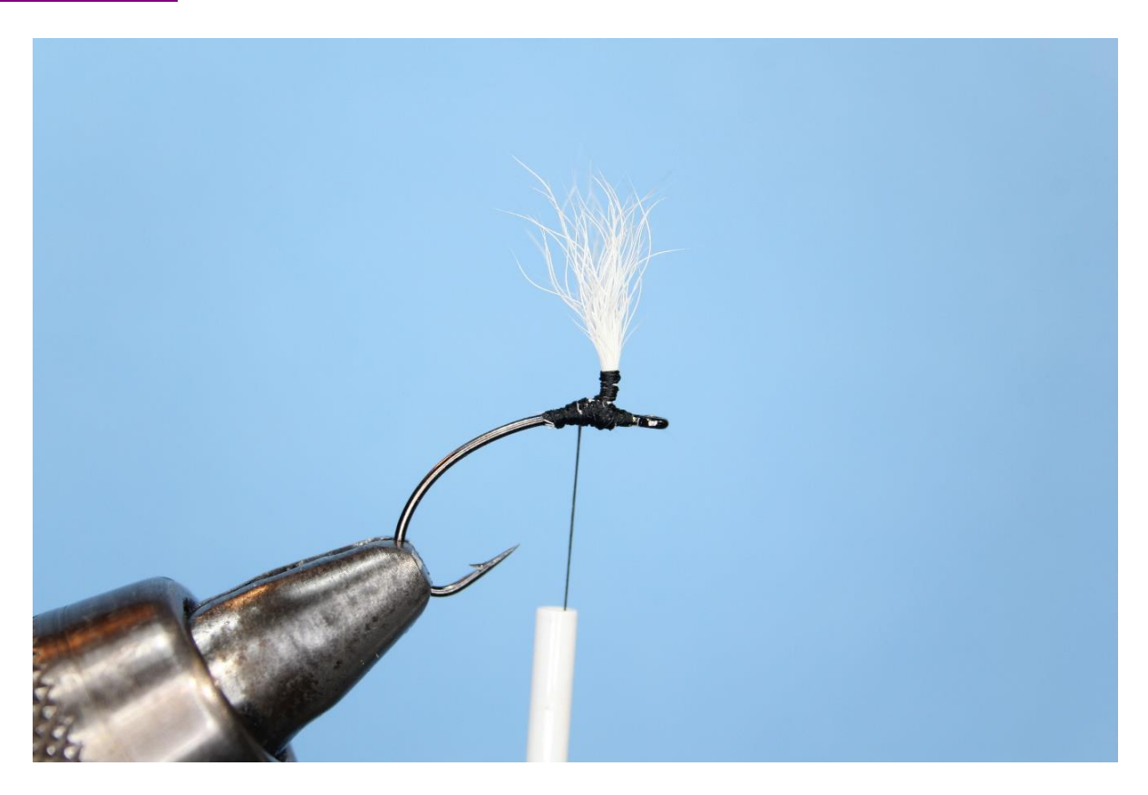
Step 1 Stack calf tail fibers to line up the tips and secure them as a wing post. Wrap your thread around the base of the wing post. Here is where we tie in the grizzly hackle