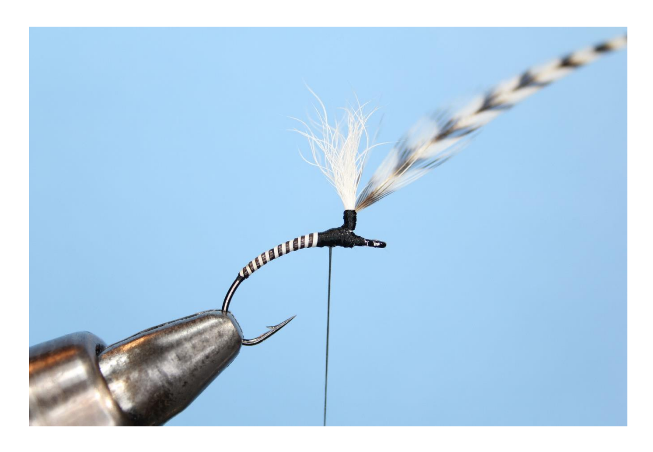
Step 6 Tie off the white and black moose mane underneath the hook shank. Then coat it with either head cement or Solarez UV Bone Dry to protect the body and make it more durable.