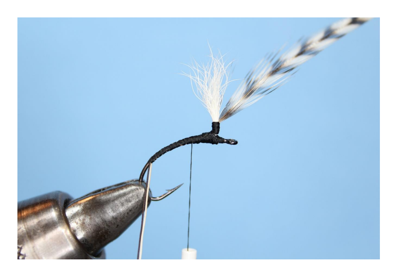
Step 4 Wrap your thread to the bend of the hook, keeping the 2 strands of moose mane together and underneath the hook shank. Then bring your thread to the thorax section.