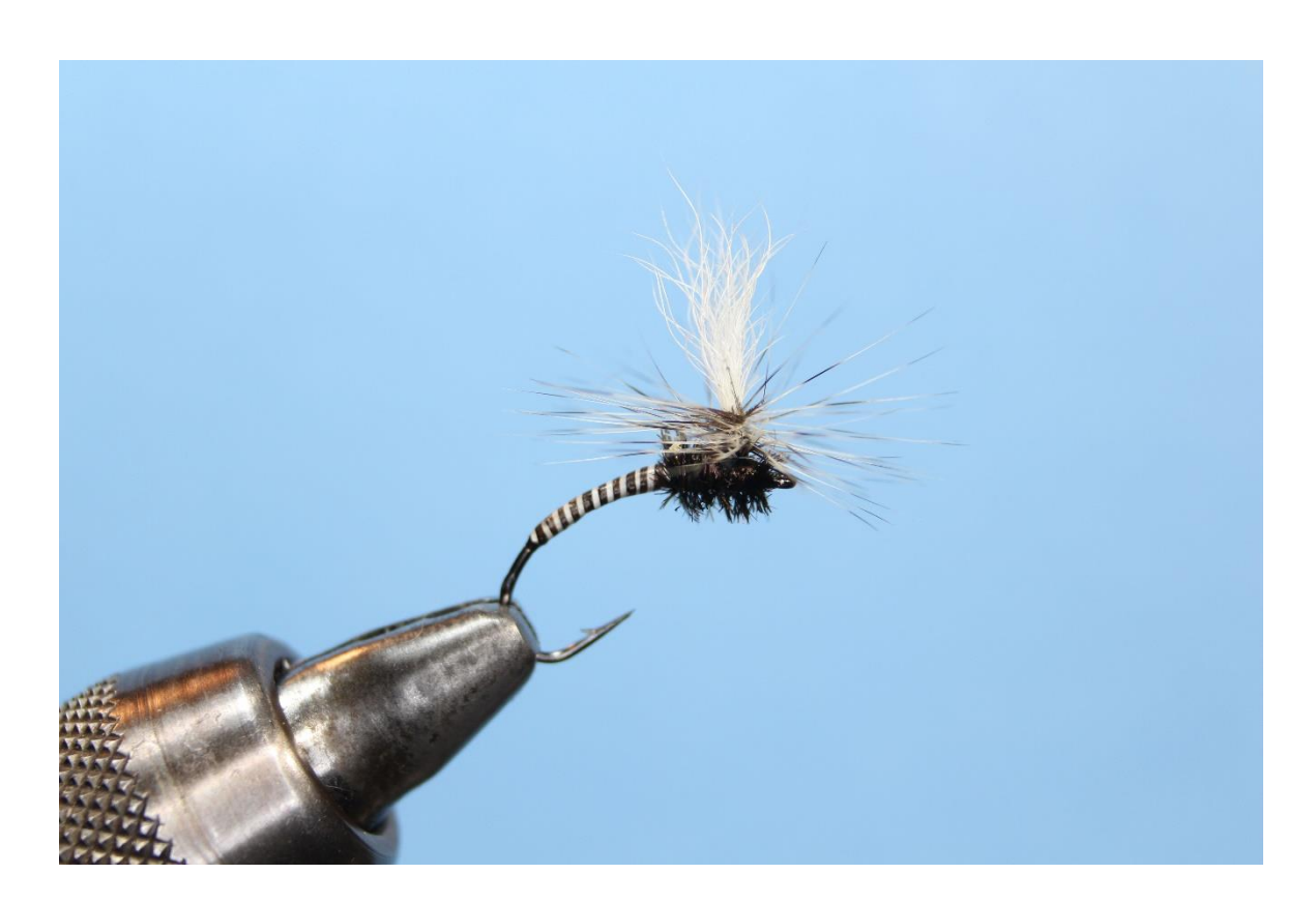
Step 11 Finished Mosquito Klinkhammer.