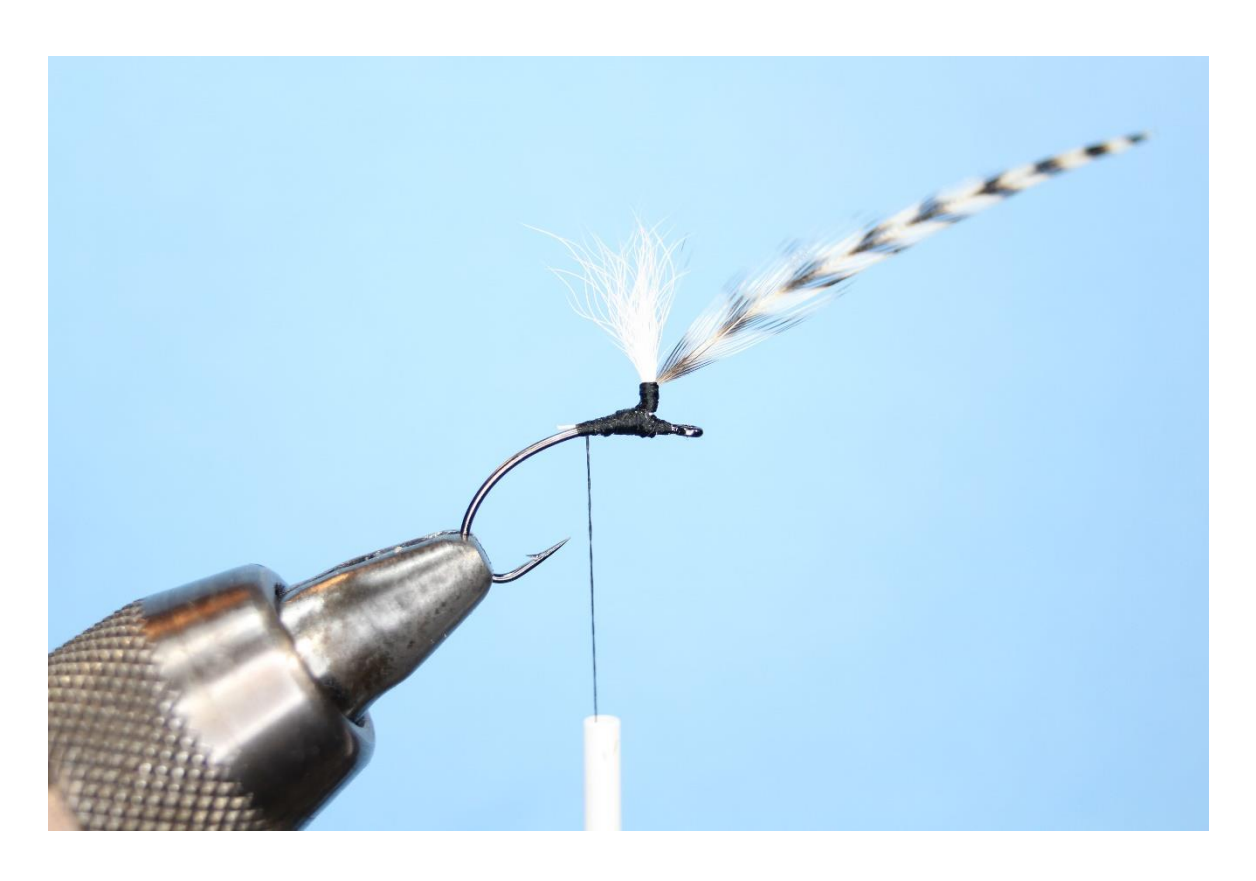
Step 2 Take a grizzly hackle and secure it on the far side of the wing. Then wrap your thread to secure the hackle to the wing post.