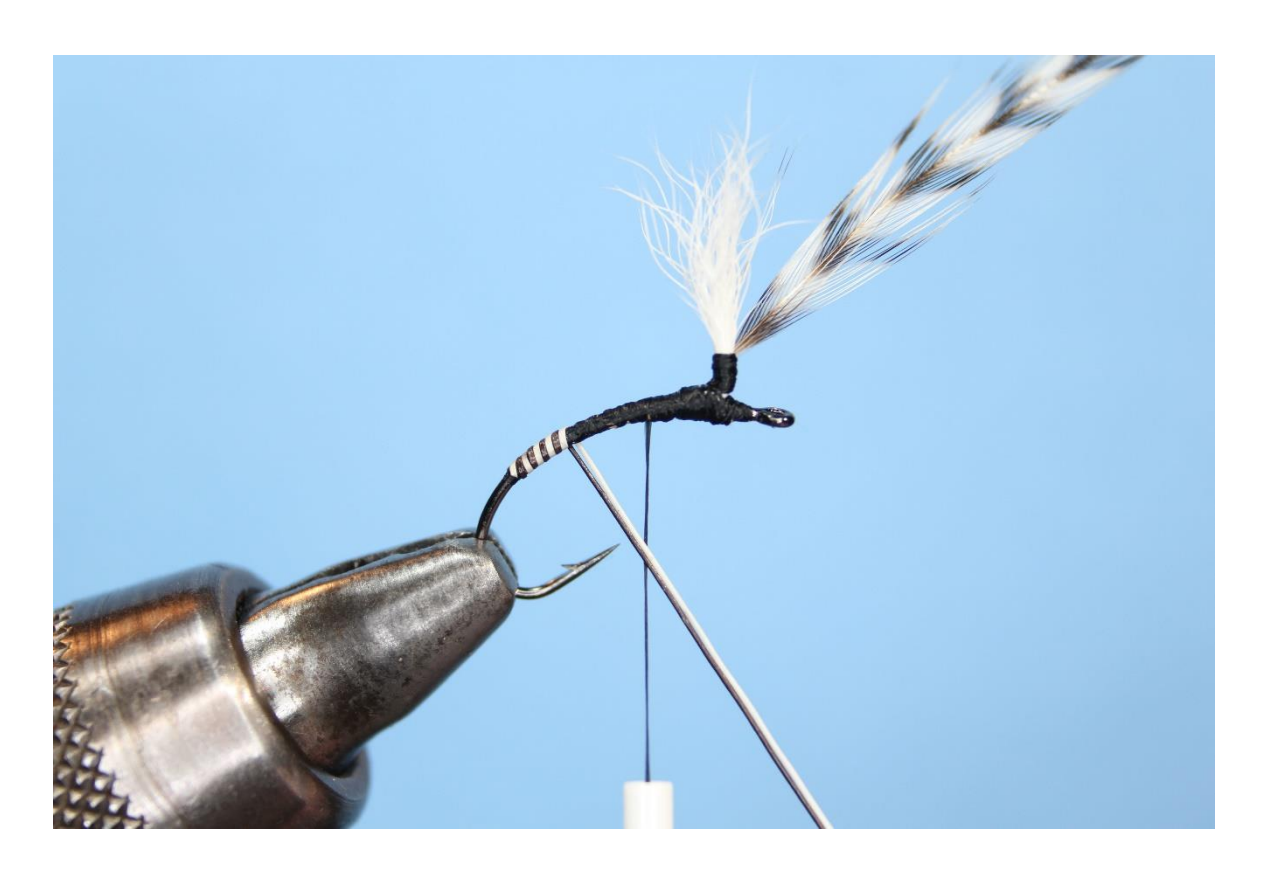
Step 5 Wrap the white and black moose mane around the shank of the hook. Making sure you do not twist the hairs. As you are wrapping keep the black moose mane under the white moose mane.