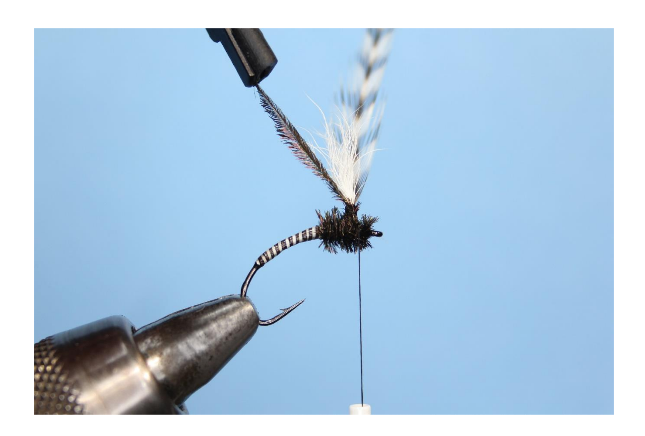
Step 8 Wrap the two peacock herls to form the thorax and secure the herls to the wing post.