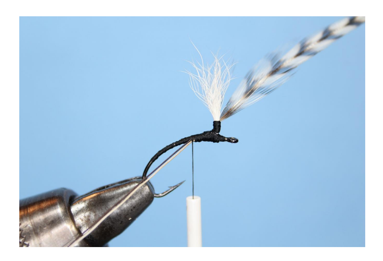
Step 3 I wrap the hook shank with the thread to help keep the materials from slipping when I attach them to the hook.

Take one white and one black moose mane hair and tie them in together. Do not twist them.