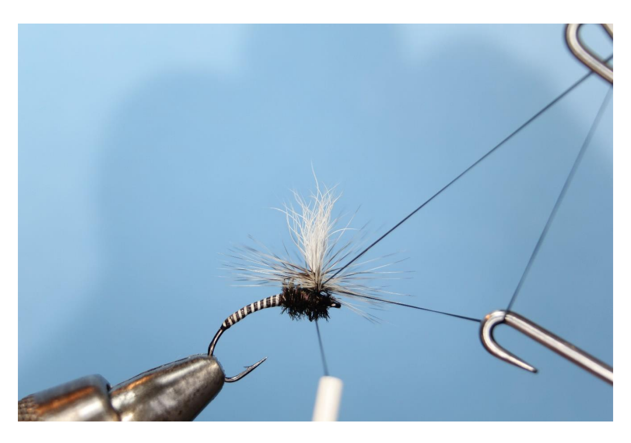
Step 10 Whipfinish under the hackle wraps. Add a drop of head cement or Solarez Bone Dry to the base of the wing post. This will give added protection to the parachute hackle wraps.