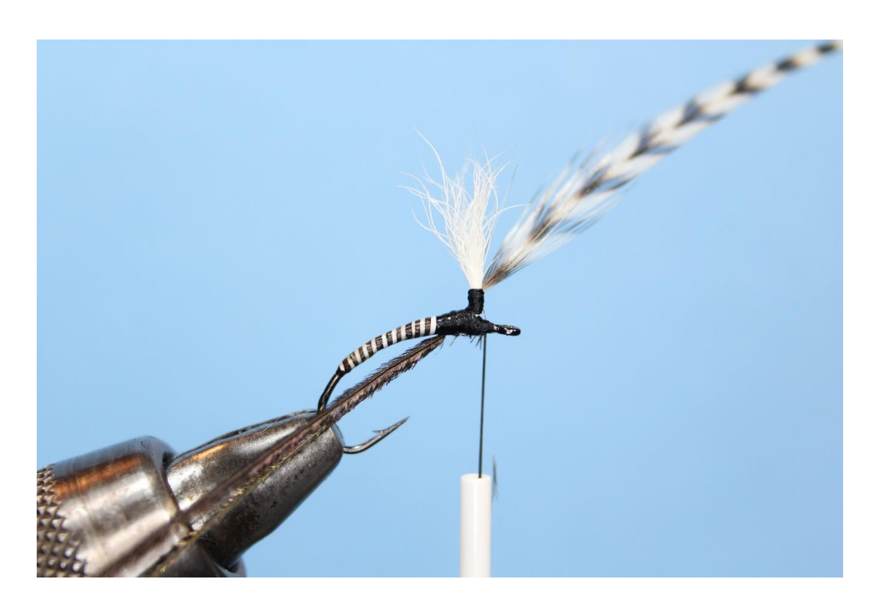
Step 7 Tie in two peacock herls for the thorax.