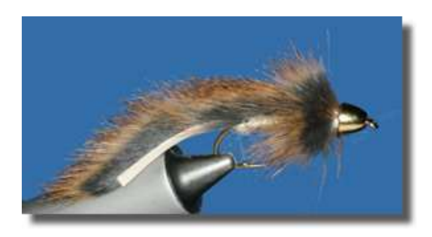
Published by Bob Bates Federation of Fly Fishers - Washington Council