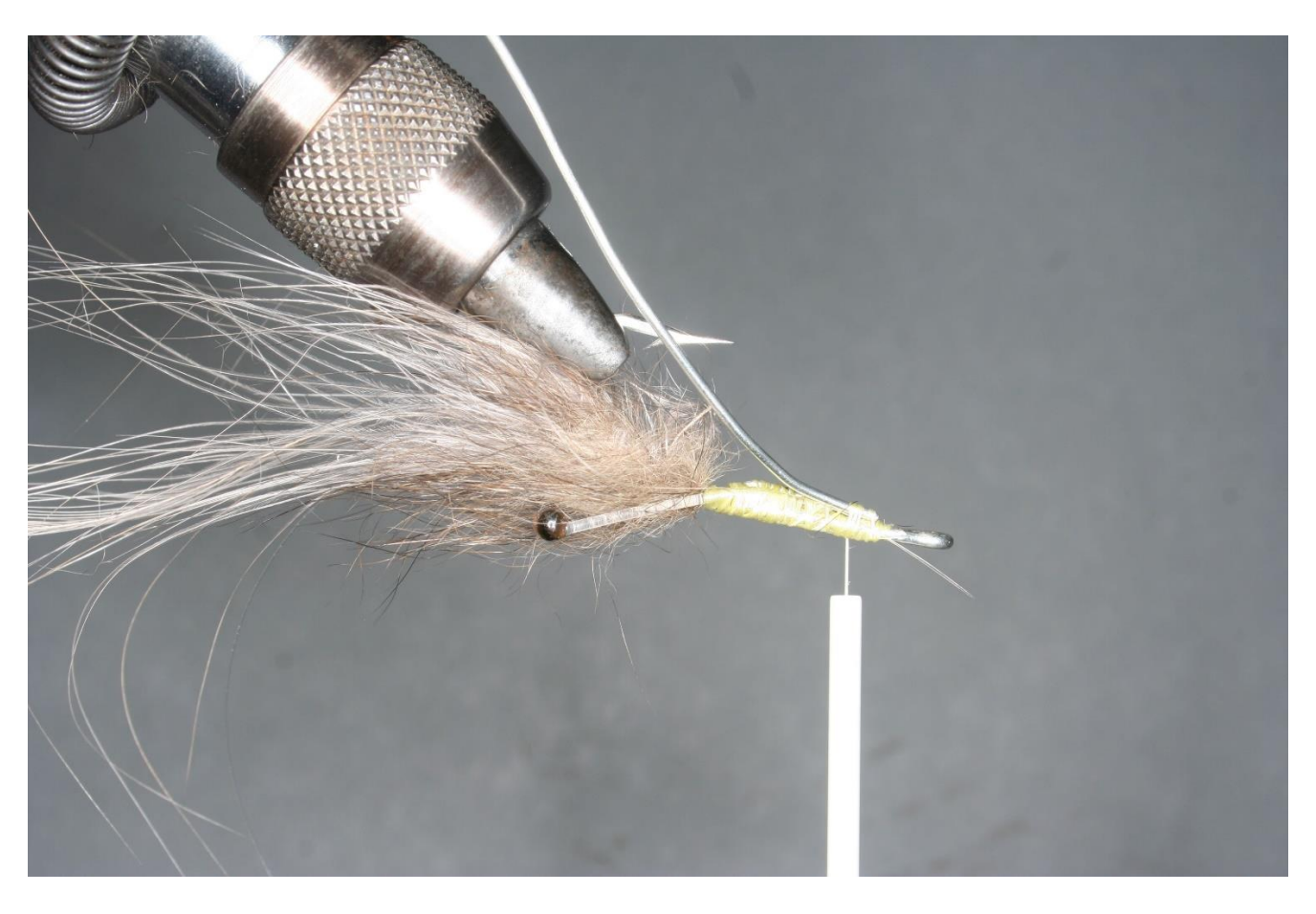
Step 6 Tie in 2 strips of lead free wire on the bottom of the shank of the hook.