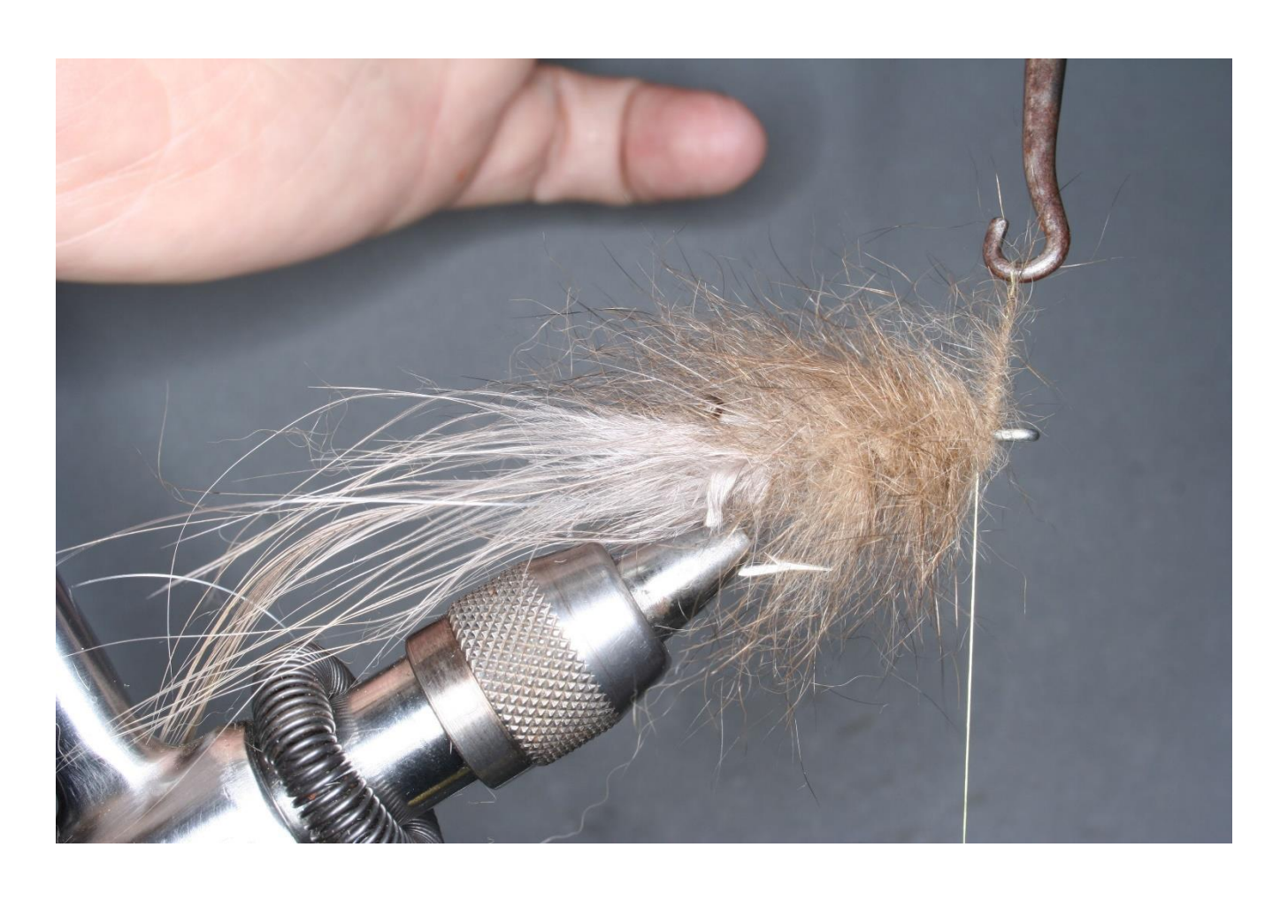
Step 9 Once you get to the eye of the hook, secure and cut the material.