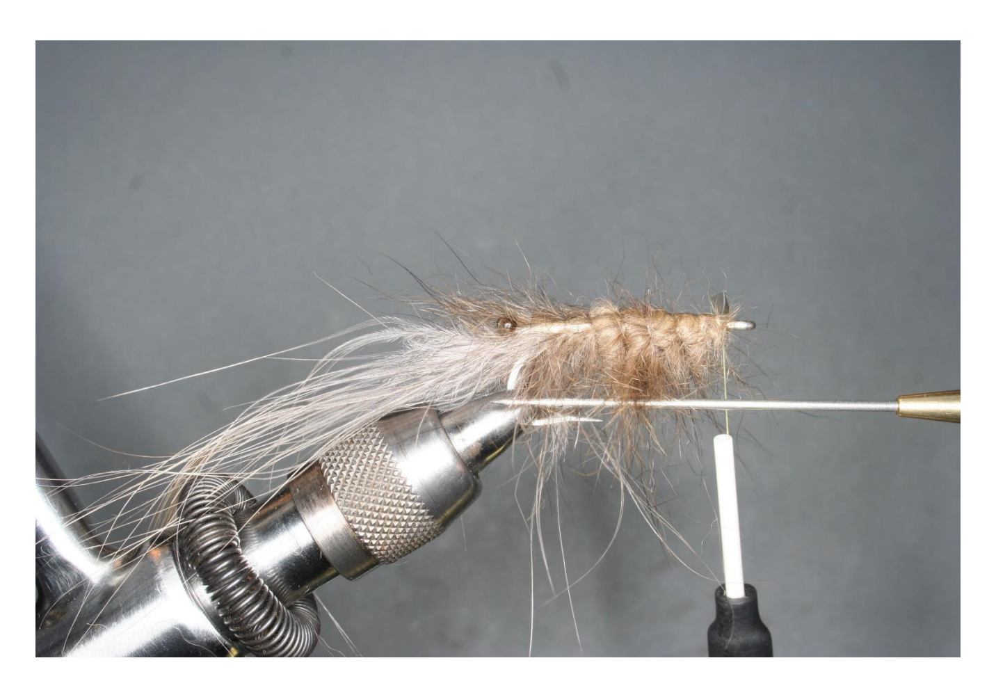
Step 13 Use your dubbing needle to free any fur trapped by the monofilament rib.