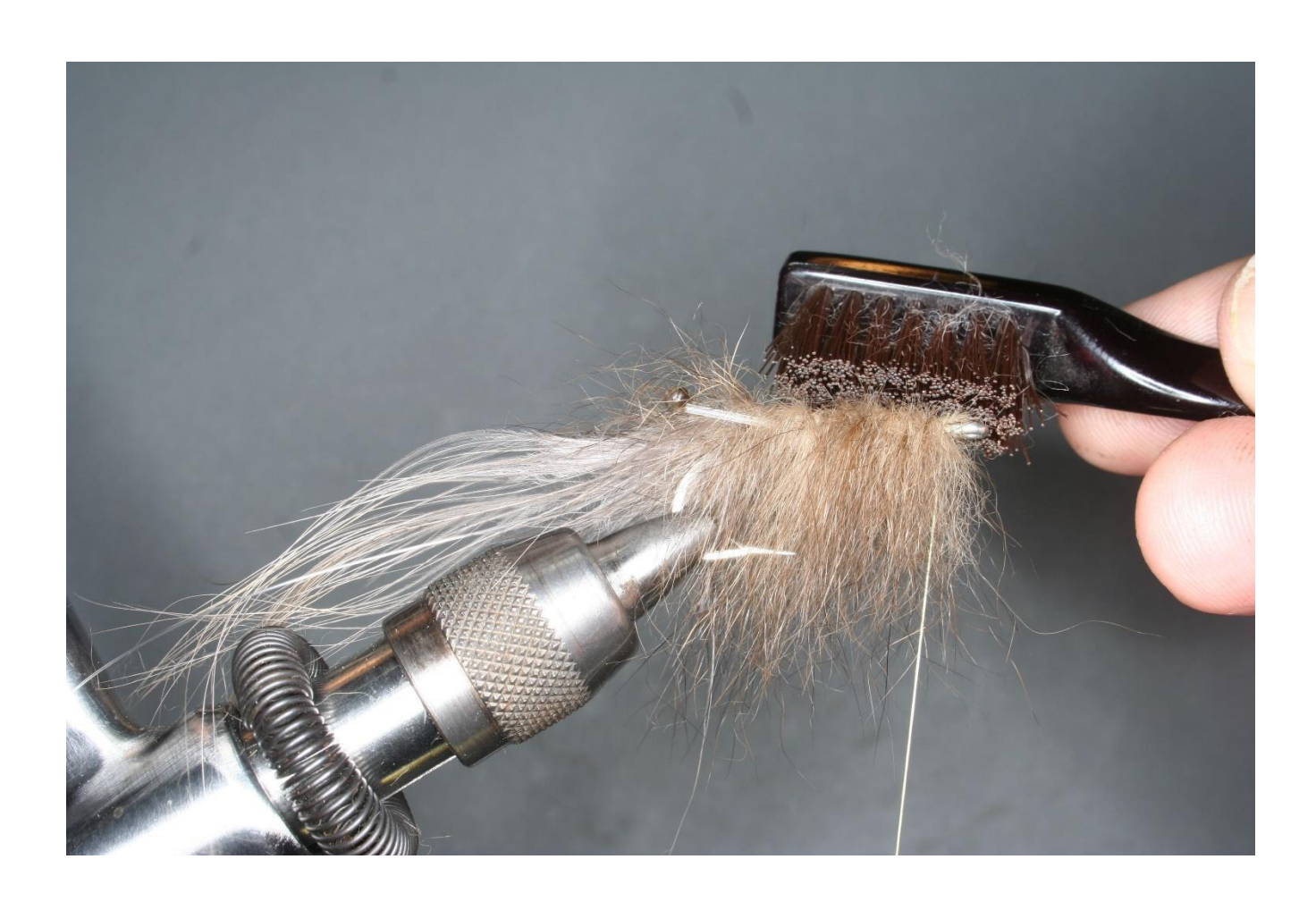
Step 10 Brush the fur downwards to form the legs of the shrimp.