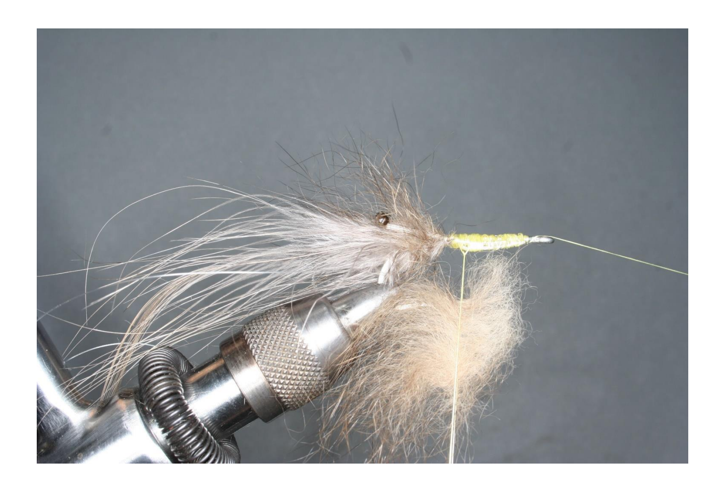
Step 7 Make another dubbing loop, and cut raccoon fur and insert the fur into the loop. Make the loop long enough to make the body of the shrimp. The guard hairs of the raccoon will be the legs of the shrimp.