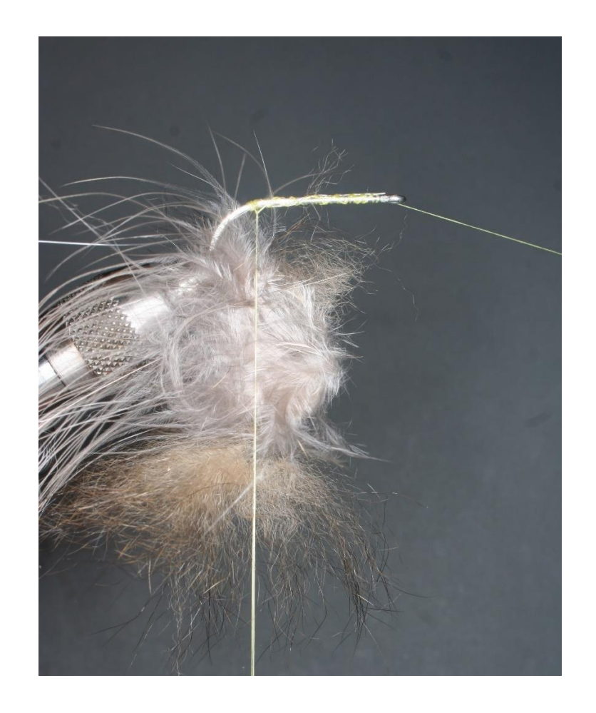
Step 3 Make a dubbing loop. Cut the raccoon fur from the hide and take a feather from the Bird Fur and insert them into the dubbing loop. This will be the beard and feelers for the shrimp.