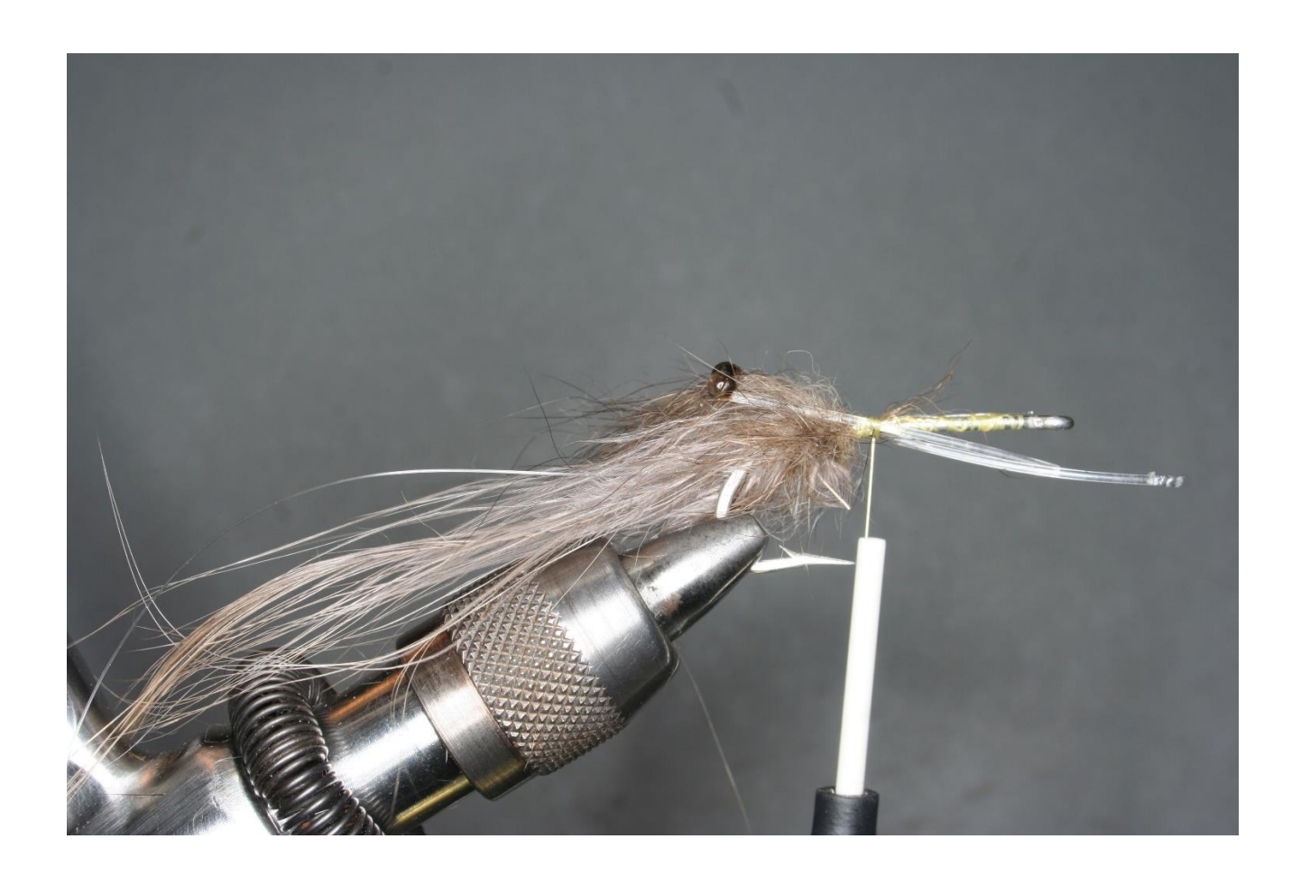
Step 5 Take 2 pieces of 30 to 50 lb monofilament and hold the end to a lighter to create an eye. Then coat the melted ball with UV Resin. Tie the eyes on top side of the beard.