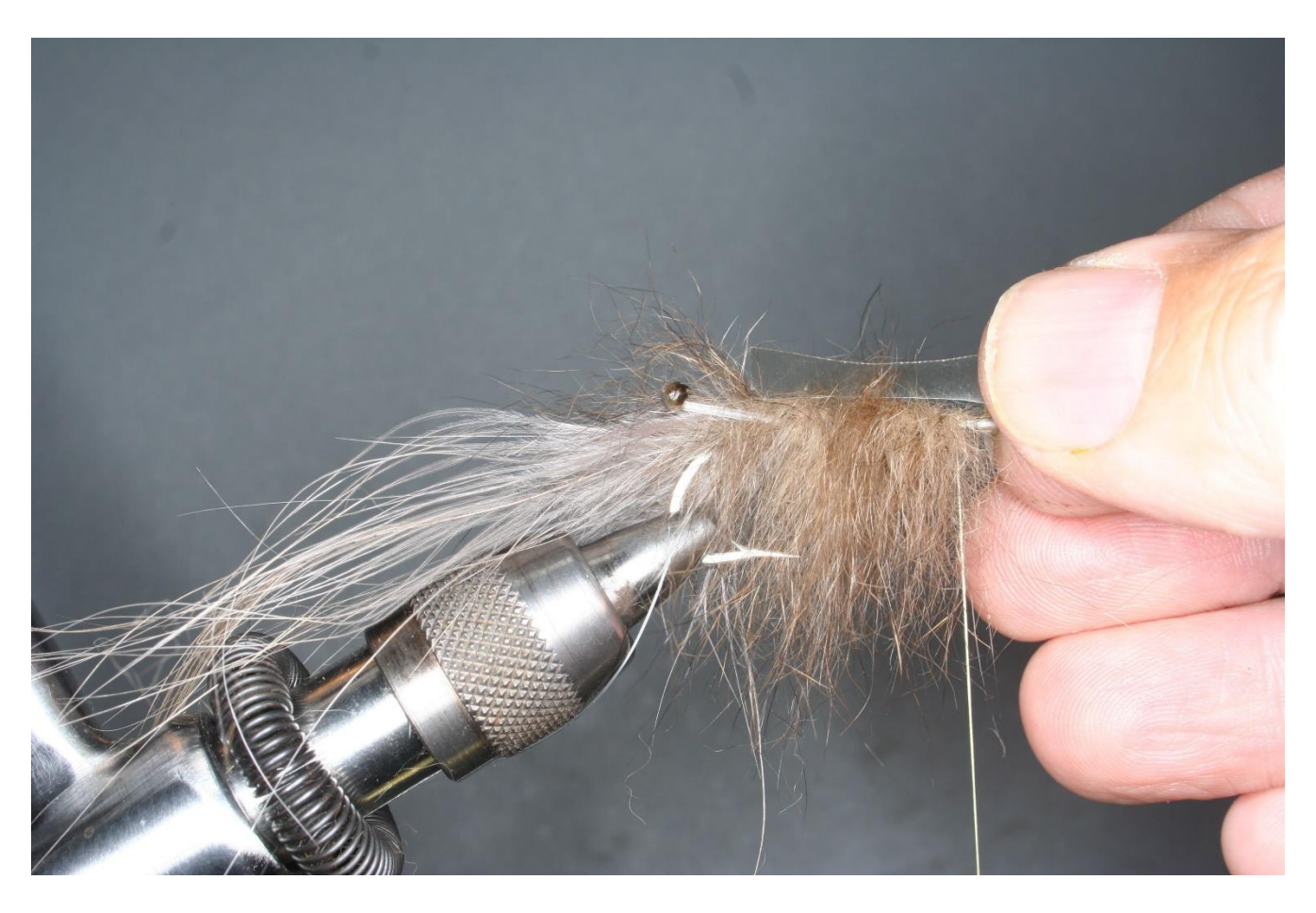
Step 11 Cut a strip of Thin Skin, I am using tan. This will be used for the shell back of the shrimp. Secure it at the eye of the hook.