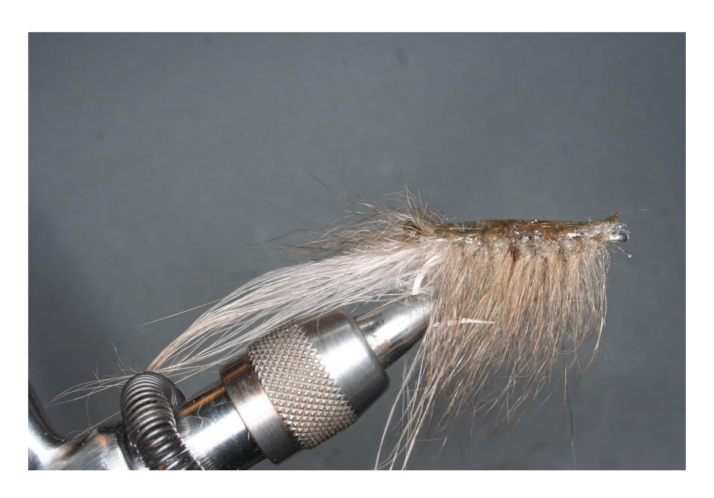
Step 17 Finished Raccoon Shrimp.