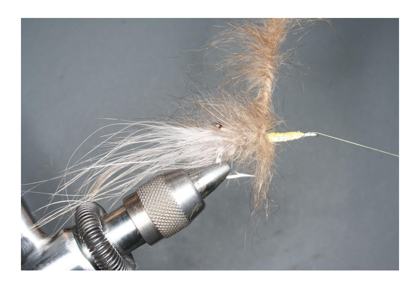
Step 8 Once you twist the dubbing loop to form a brush, wrap the brush over the shank of the hook. Stroke the guard hairs downward and towards the bend of the hook.