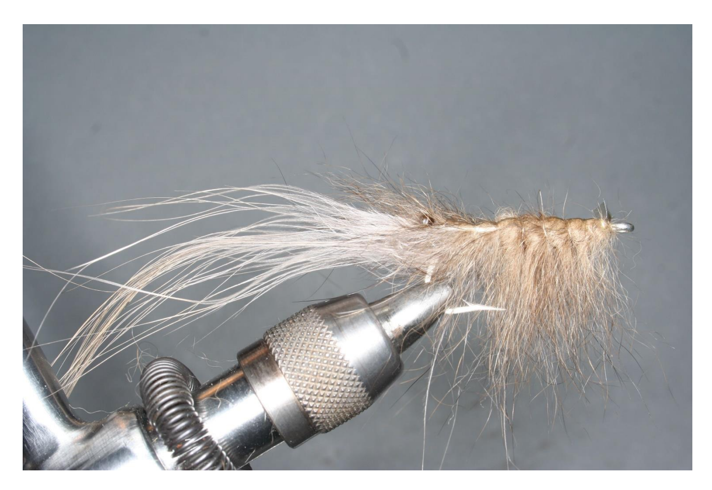
Step 14 Whip finish.