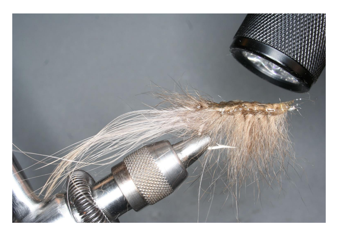
Step 16 Use a UV lamp to set the UV Resin. This will harden in a few seconds.