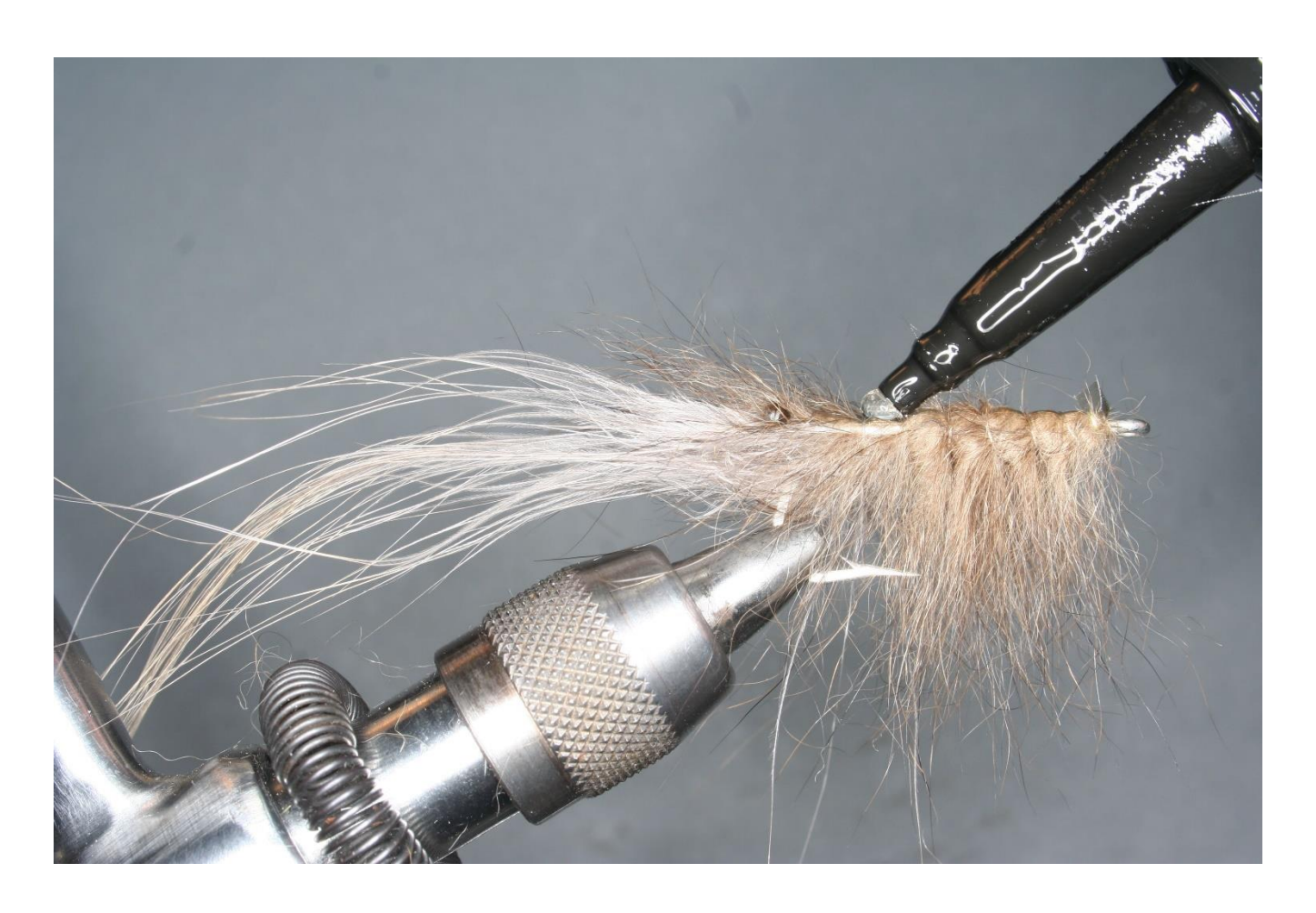
Step 15 Apply the UV Resin to the top of the shrimp to create the shell.