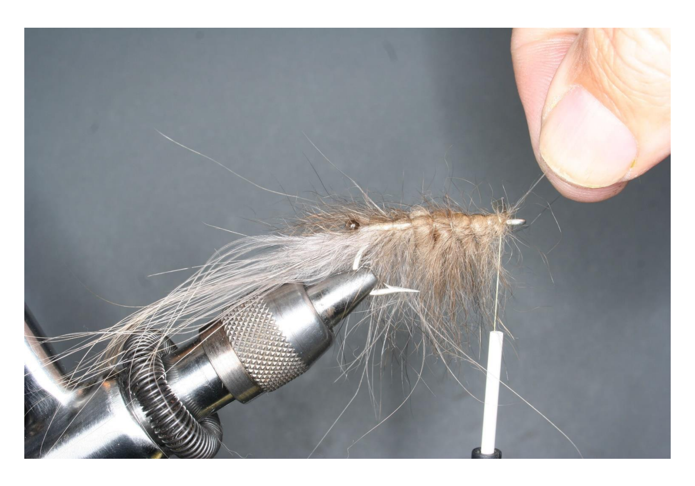
Step 12 Rib the shrimp with the monofilament, then tie it off at the eye.