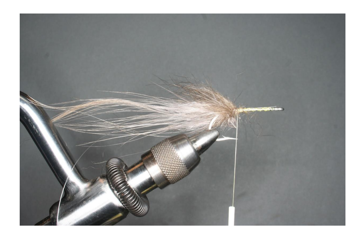
Step 4 Spin the dubbing loop, and stroke all the fibers in one directions. Wrap the dubbing loop at the bend of the hook. Make sure you stroke the fibers towards the bend of the hook. The Bug Fur Feather will be the feelers and the raccoon fur will be the beard of the shrimp.