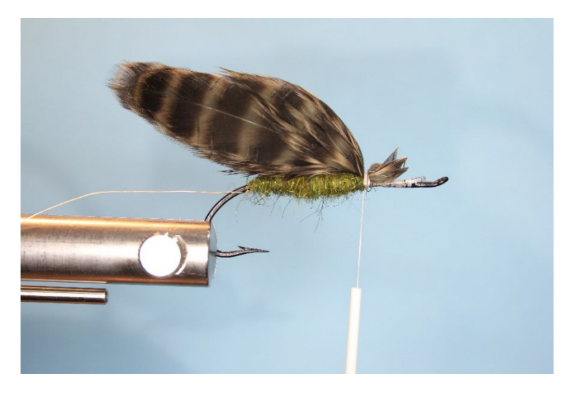
3. I am using Hen Back Grizzly feather dyed olive, cree, and light olive. There are 6 feathers on each side for a total of 12 feathers for the wing back. This will be tied in matuka style.