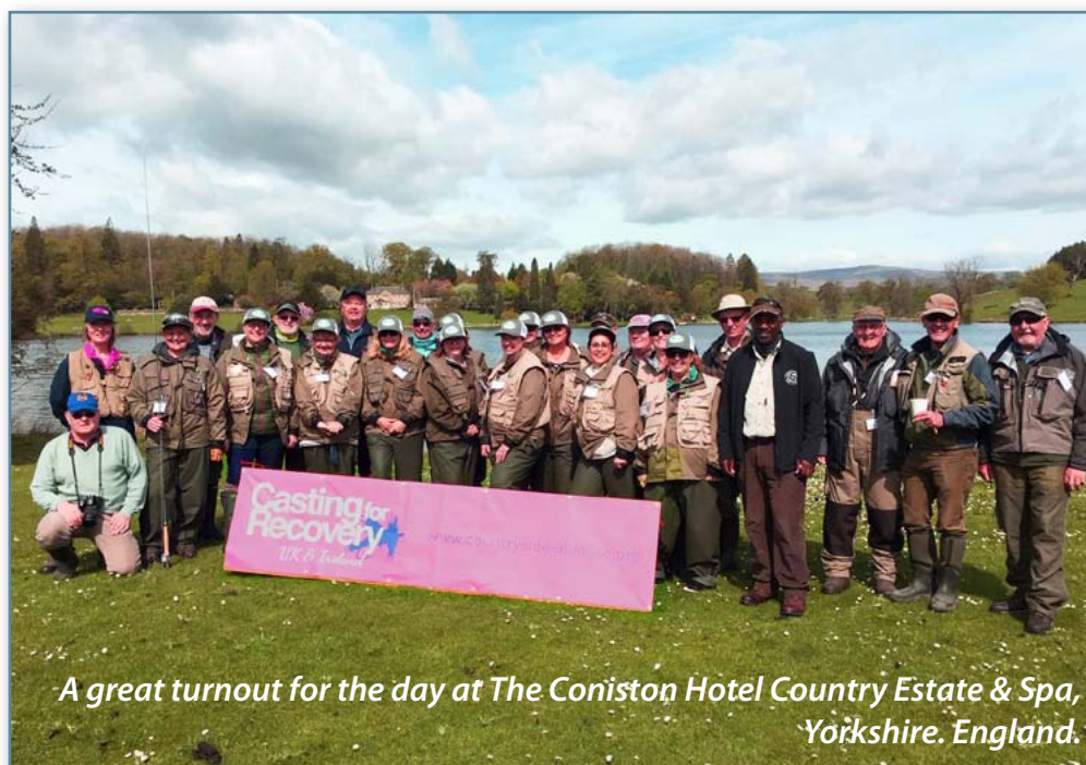
A great turnout for the day at The Coniston Hotel Country Estate & Spa, Yorkshire, England.

I find the smooth, graceful arm and body movements involved in fly casting extremely relaxing as I “tune in” and “go with the flow.” Even the concentration required