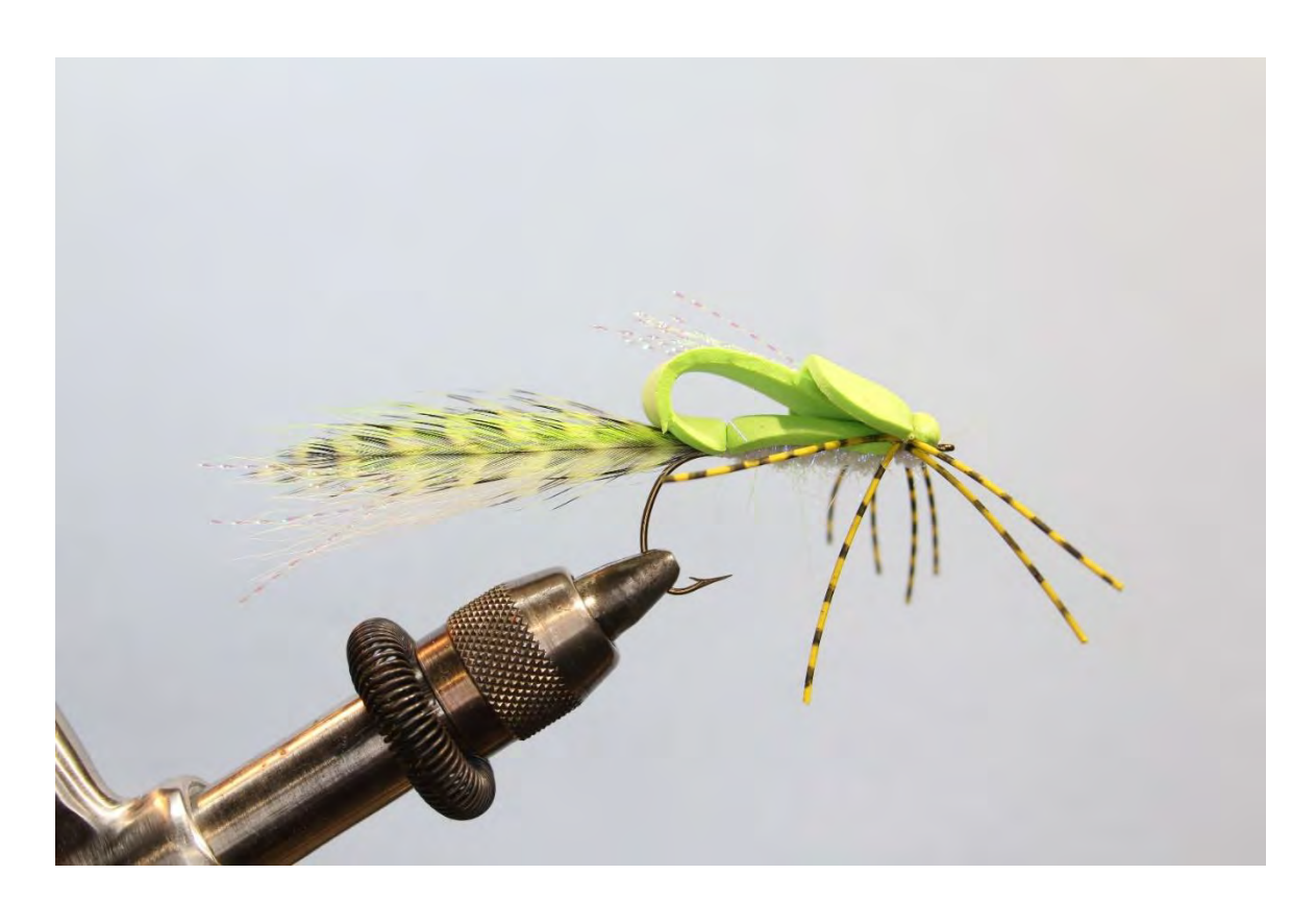
Step 15 Whip Finish. I put Bone Dry on the thread wraps to secure the whip finish in Don't be afraid to try different materials, such as a fur dubbing loop instead of the ostrich herl.