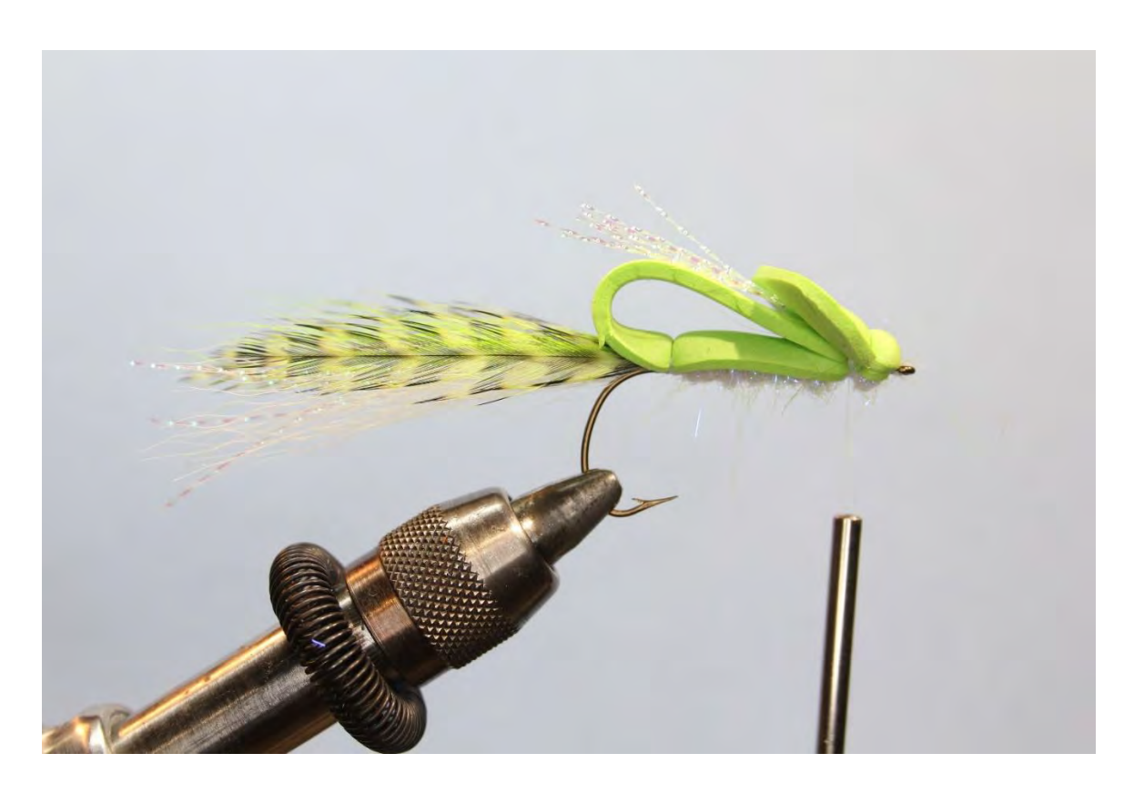
Step 13 Fold the foam head over and tie it in at the second foam tie in point. This is the head that will make the fly dive and slide under the water.