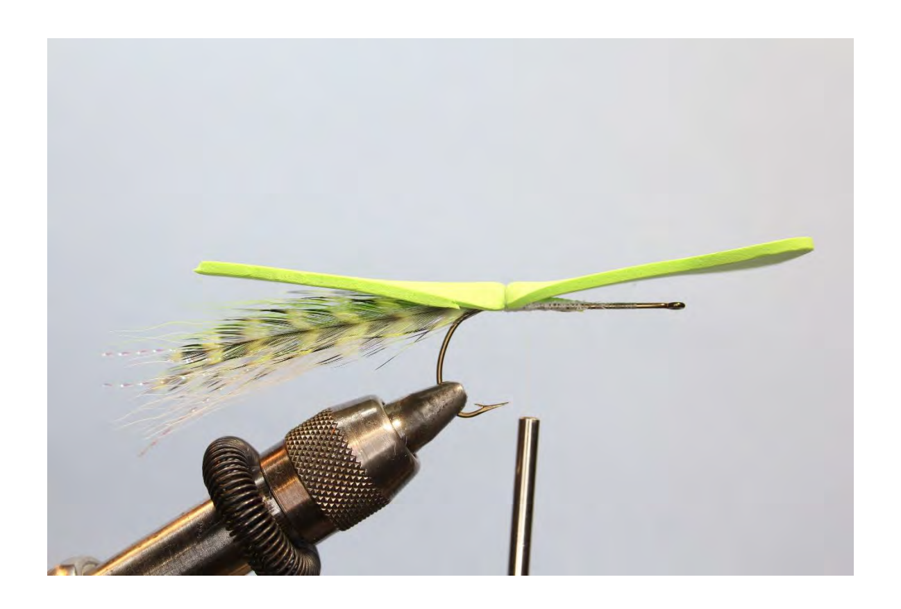
Step 5 Tie in the stealth bomber cutout at the bend of the hook. Line up the where the foam starts to tapper at the eye of the hook. Secure the foam at the bend of the hook.