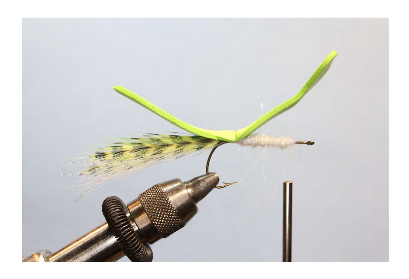
Step 6 Dub a sparse body. A little over 60% of the hook shank.