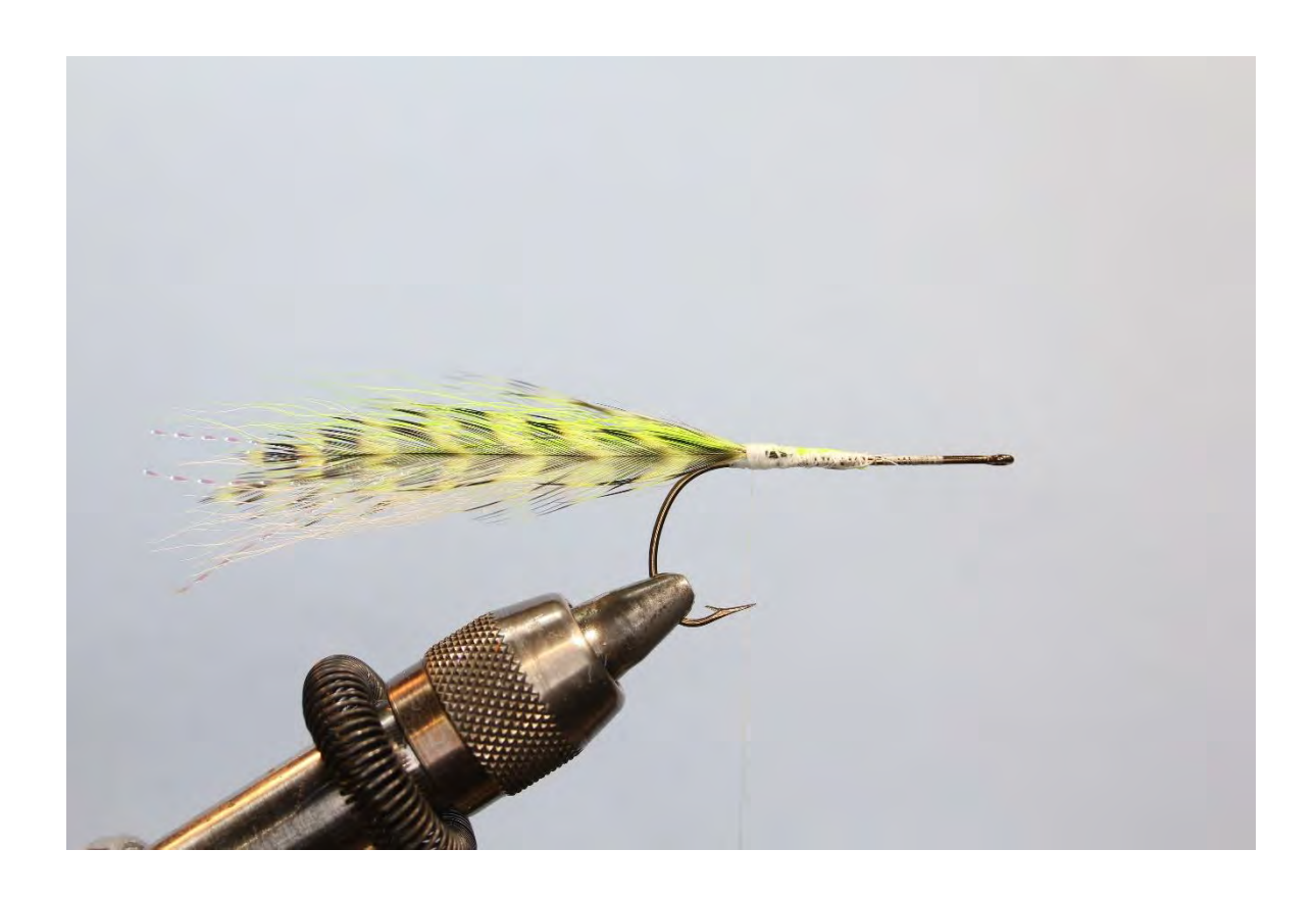
Step 4 Tie in two saddle hackles on each side of the hook.