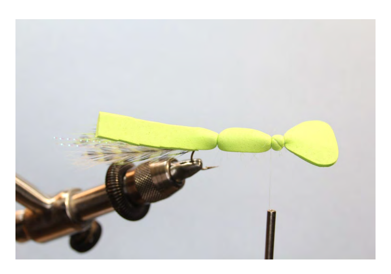
Step 10 Bring your thread on top of the foam to the second tie in point.