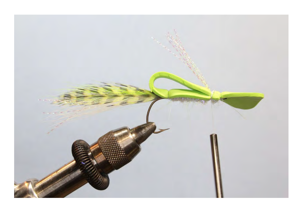
Step 12 Over wing of Krystal flash tied in at the second foam tie in point. About 6 to 10 strands