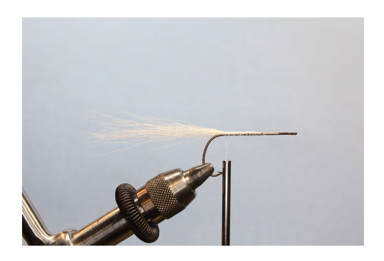
Step 2 Tie in 6 strands of Krystal Flash at the bend of the hook. The same length as the bucktail.