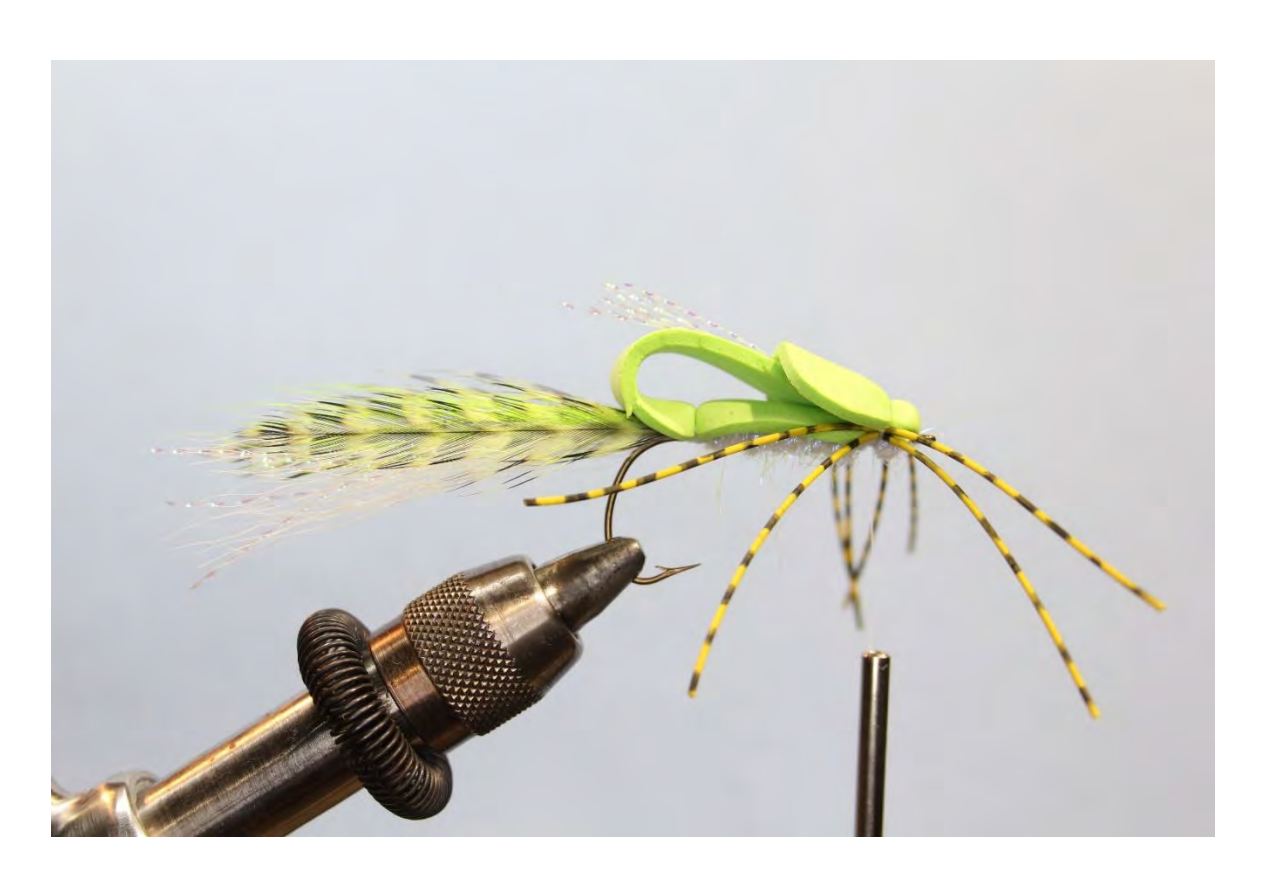
Step 14 Tie in 2 strands of rubber legs on each side of the fly.