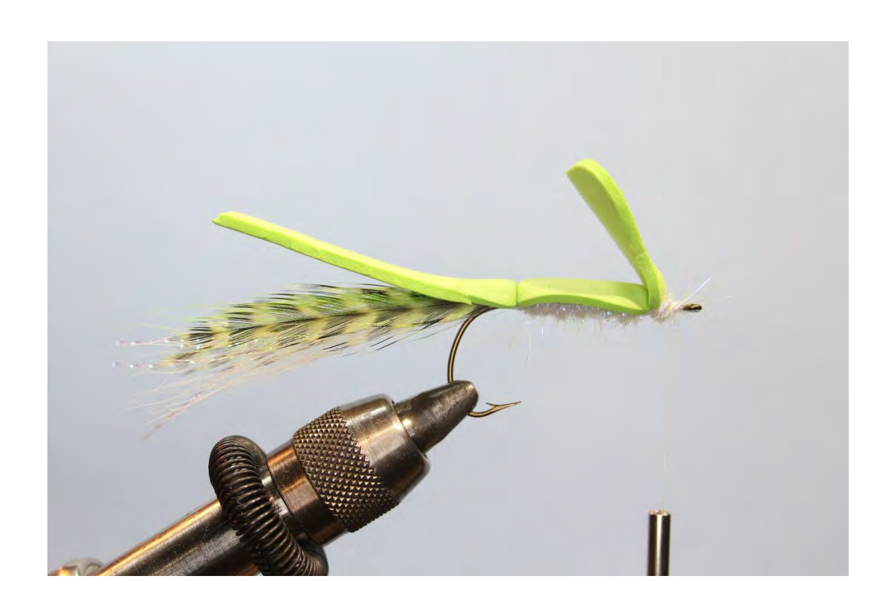
Step 8 Add more dubbing in front of the foam head.