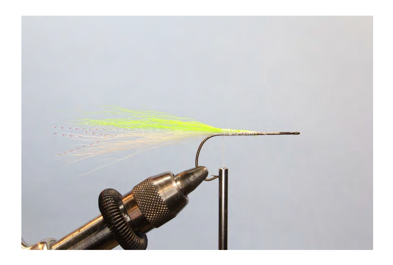
Step 3 Tie in Chartreuse Bucktail the same length as the white bucktail at the bend of the hook.