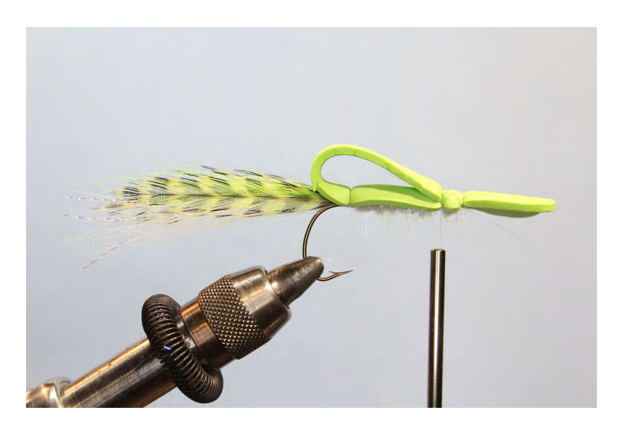
Step 11 Pull the foam that is at the bend of the hook to form a bubble. Tie the foam to the second tie in point. This will make a lot of noise and bubbles when pulled through the water.