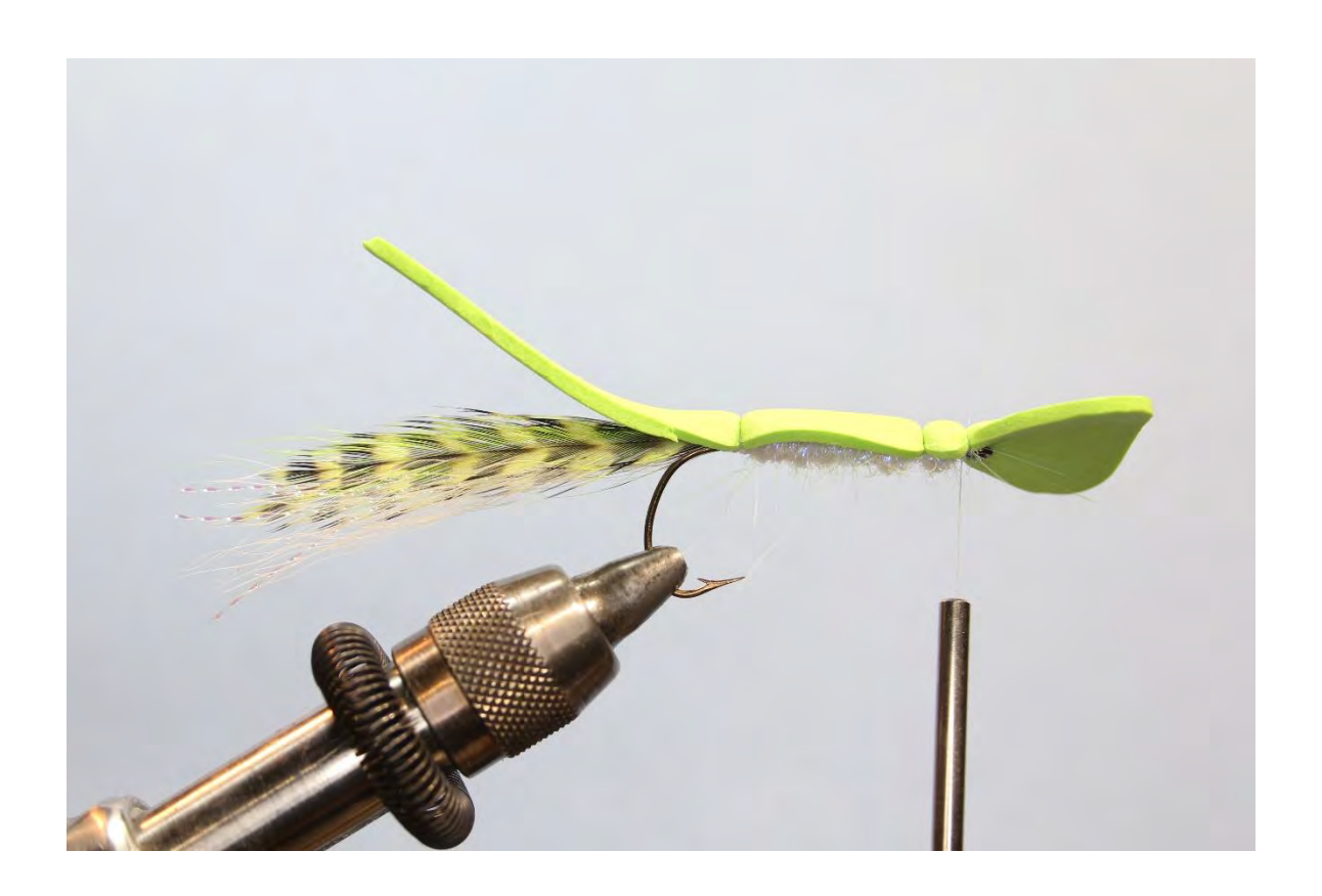
Step 9 Pull the foam head over the dubbing and secure the foam behind the eye of the hook.